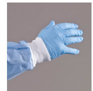
Premium Elastic Cuffs