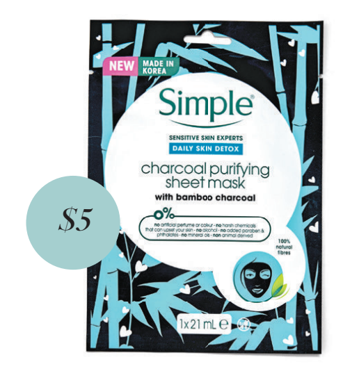
Luxe to less Spascriptions Charcoal Gel Face Mask, $18. OMG! 4 in 1 Kit Zone System Mask, $17. Simple Charcoal Purifying Sheet Mask, $5.