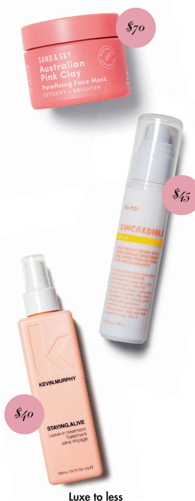
Luxe to less Sand & Sky Australian Pink Clay Face Mask, $70. Go-To Zincredible SPF15 Daily Moisturiser. $45. Kevin.Murphy Staying Alive Leave-in Treatment, $40