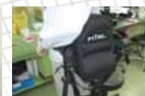
④ Working Belt as Shoulder Pack