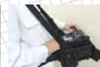
④ Working Belt in Action