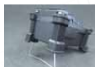
③ Angled Stand in Action