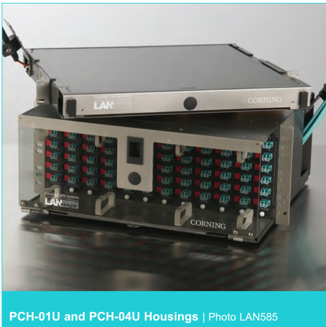
PCH-01U and PCH-04U Housings | Photo LAN585