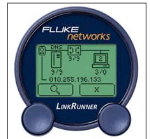
Ping DNS server or key devices, and observe response time.

Quickly verify and troubleshoot network drops with this essential, personal tool.