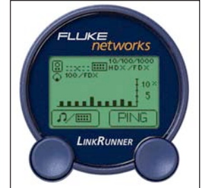
See device capabilities, actual link speed, and utilization levels.