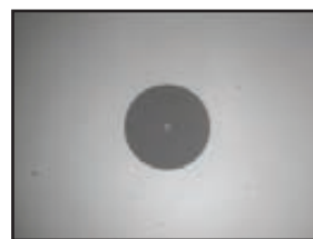
Pass or Fail?