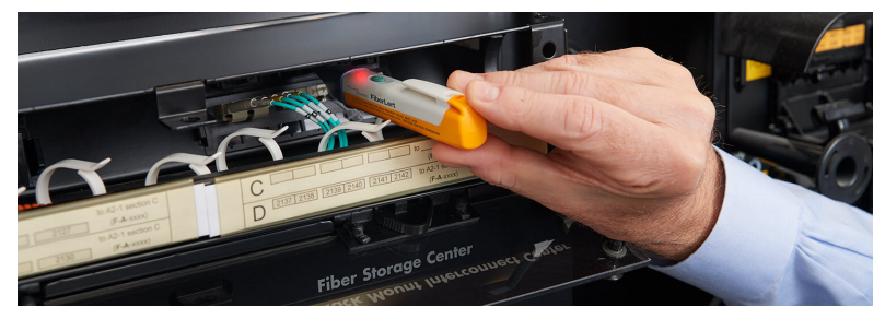
Determine if a port is live. Small size makes it easy to access cramped patch panels.