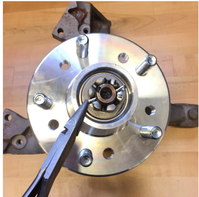
9 & 10

Pack the large inner bearing cone (A5) with high temperature disc brake bearing grease (available from your local auto parts store) and install into the back side of the hub. The inner seal can then be pressed in or lightly tapped in with a hammer by circling the perimeter. Install the hub onto the spindle, then pack the outer bearing (A3) with grease and install under the factory washer, castle nut, and supplied cotter pin.