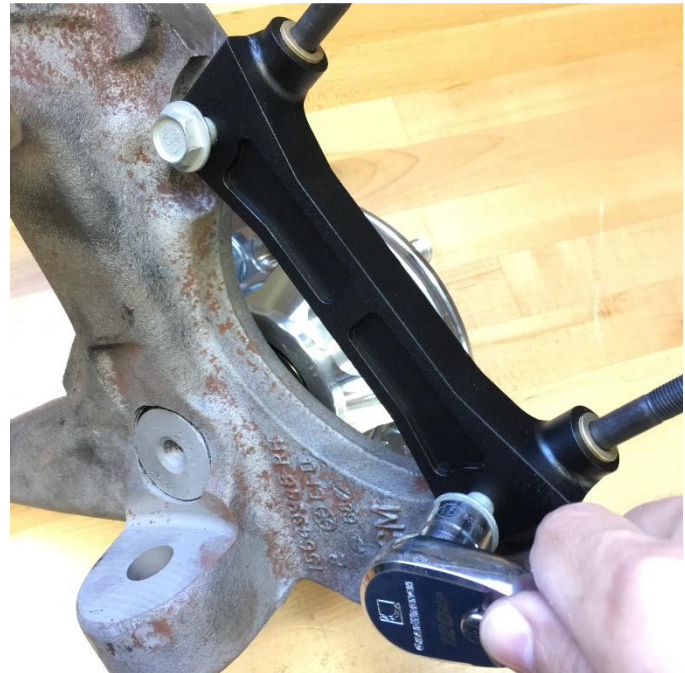
11 & 12

Install the dust cap by tapping lightly around the perimeter. The radial brackets can temporarily be installed at this time using the supplied flange bolts and two .750x.438x.035 shim washers between the bracket and the spindle. Any corners or burrs on the spindle should be removed so that the brackets sit flat against the machined surface. It is not necessary to torque them at this time.