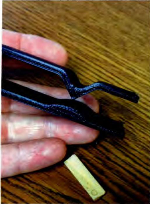
#1 - 3D Printed Cone separator