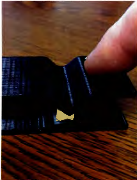
#3 - Place onto flat surface