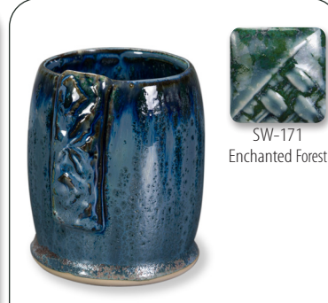
SW-184 Speckled Toad over <u>SW-171 E</u>nchanted Forest

SW-184 Speckled Toad over SW-169 Frosted Lemon