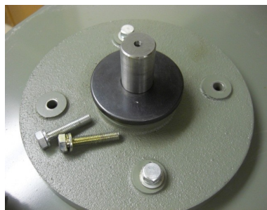
(2) Remove the 2 bolts