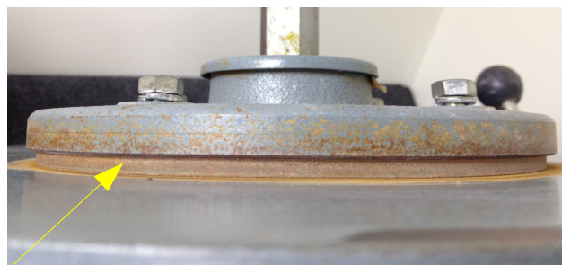
Round Bearing Holder with groove

If your RK-2 has a round bearing holder with a groove then it can hold a two piece splash-pan. Contact Shimpo Ceramics for additional splash-pan info.