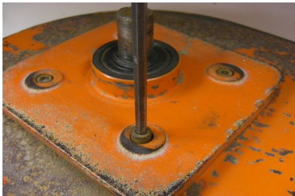
(1)Remove wheel head