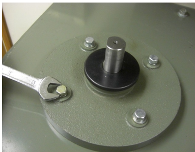
(1) Remove wheel head