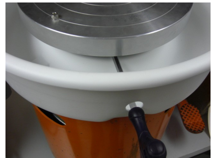
(5)Tighten wheel head bolt through the hole in pan