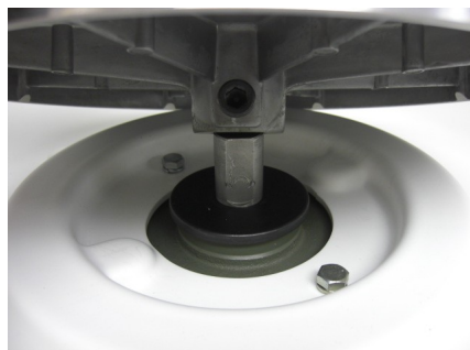
4)Wheel head bolt must be tightened to flat side of shaft to ensure wheel head is secure