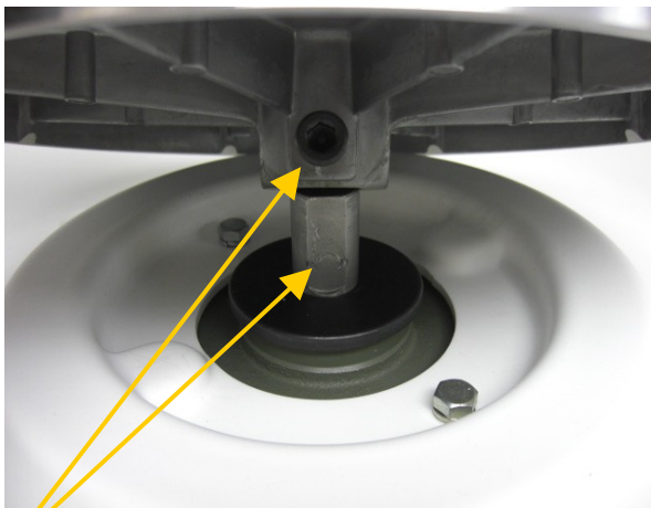
(4) Wheel head bolt must face to flat part of the shaft so the wheel head remains secure