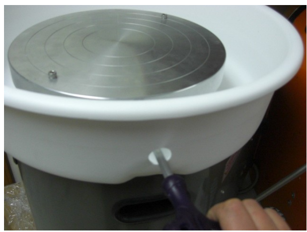
(5) Tighten wheel head bolt from the hole in the splash pan