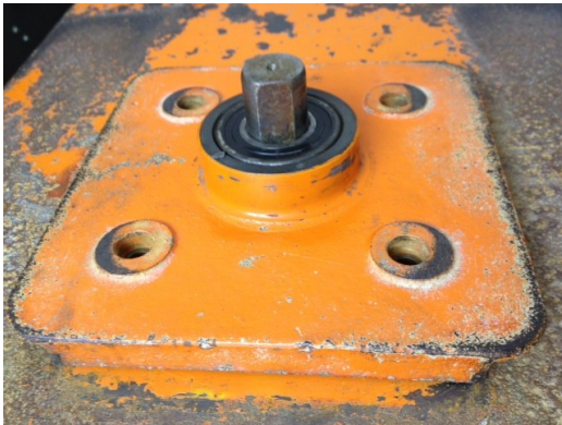
Square bearing holder

In most cases the RK-2's can only fit a one piece splash-pan. A wheel with a round bearing holder with no groove and a wheel with a square bearing holder can only fit a one piece splash-pan.