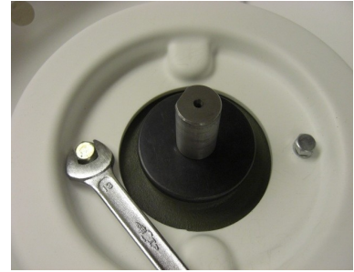
(3) Tighten the 2 bolts