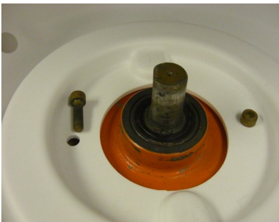
(3)Tighten 2 bolts to shaft from