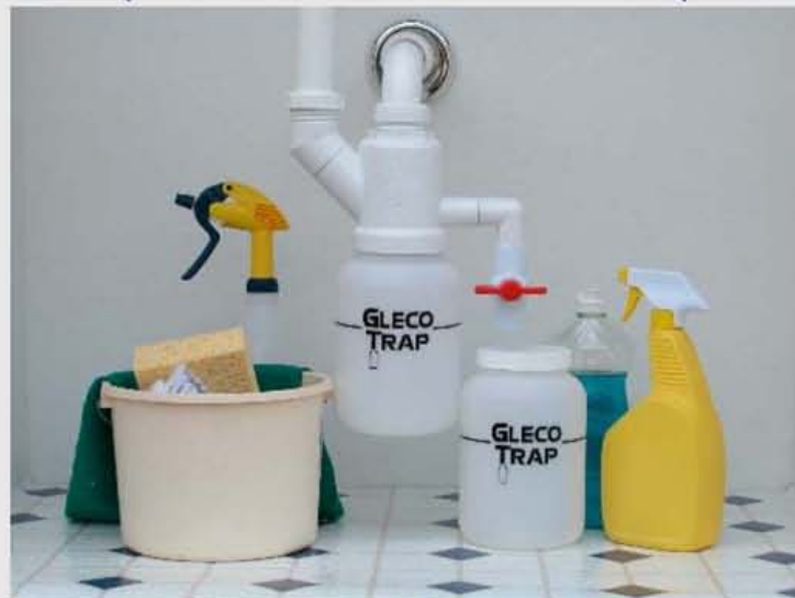
Step 5: DONE!