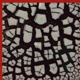
SG-201 Black Cobblestone