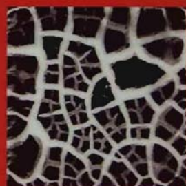
SG-202 White Cobblestone