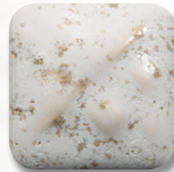
SW-118 Sea Salt