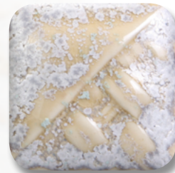
SW-118 Sea Salt