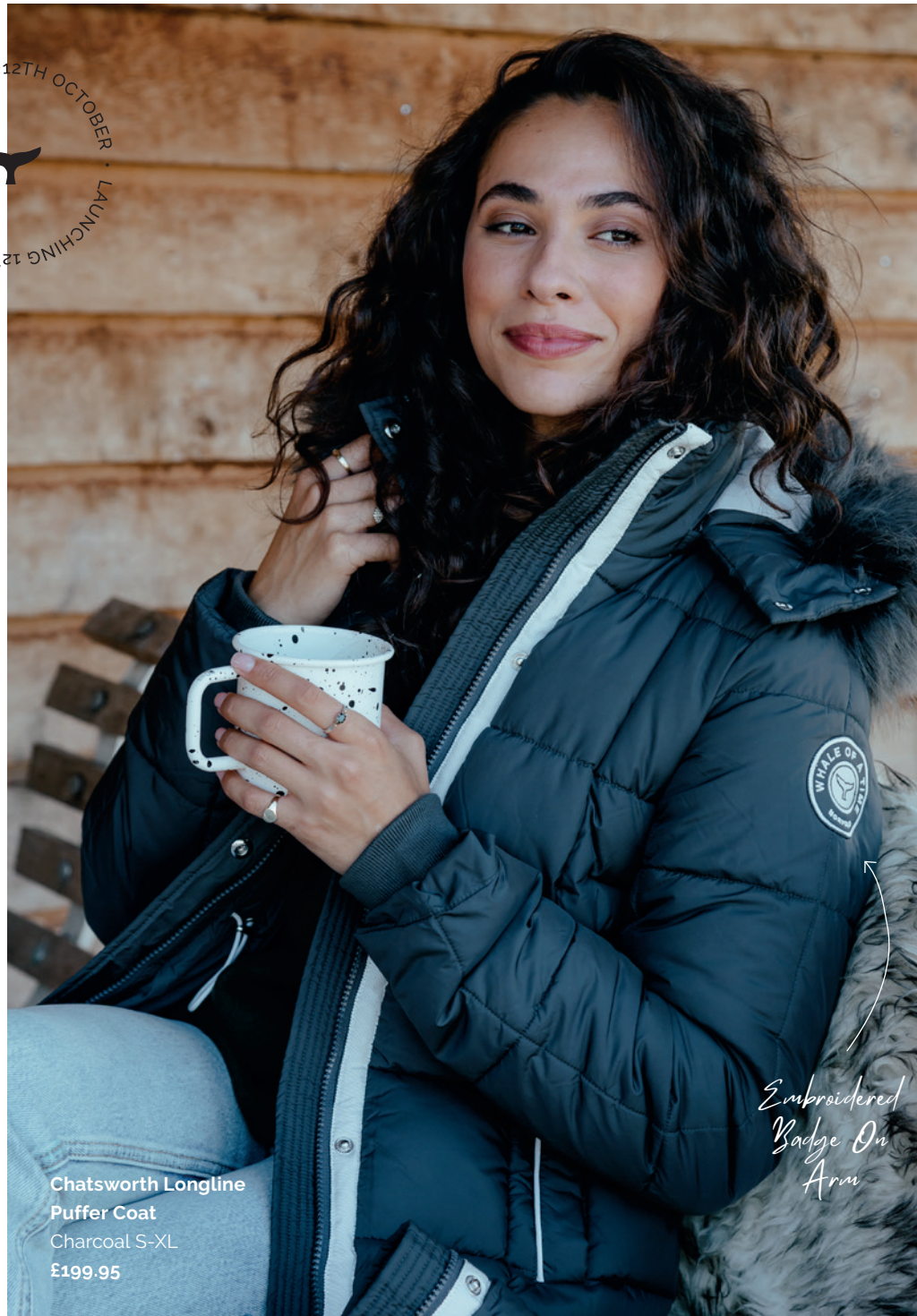
Chatsworth Longline Puffer Coat Charcoal S-XL £199.95