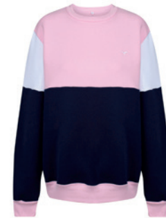
Harbour Sweatshirt Navy XXS-XL £54.95