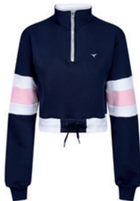
St Ives Navy