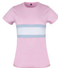
Morston Pink £32.95