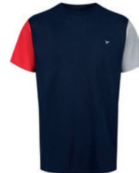
Stiffkey Navy £32.95