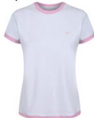
Brancaster White £32.95