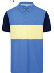
Holt Cobalt Blue £39.95