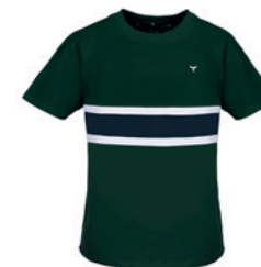
Morston Green £32.95