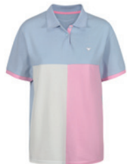
Porthurno Navy £39.95