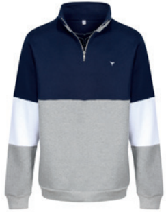
Cambridge Quarter Zip Grey XXS-XL £59.95