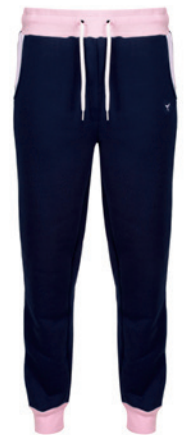
Harbour Joggers Navy XXS-XL £49.95