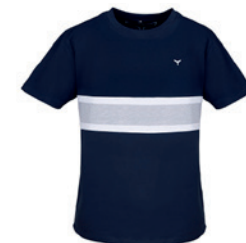
Morston Navy £32.95