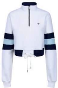
St Ives White