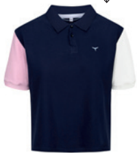
Polzeath Navy £32.95