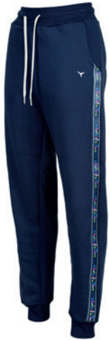
Basics Unisex Joggers Navy XS-XL £49.95