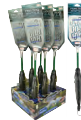
Fish BBQ Spatula