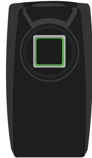
BIOMETRIC FINGERPRINT LIGHTER USER MANUAL