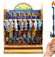
Bait Cast Fishing Pole BBQ Lighter