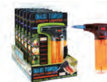
Maxi Torch Utility Lighter