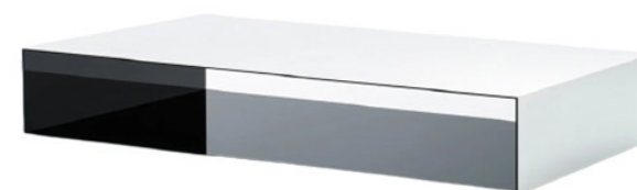
Available Dimentions: L x D x H

SiO2 Tunnel - Series of low tables with double plate in coupled laminated glass. Available in glossy lacquered and opaque lacquered glass with the possibility to combine freely the color of the inside with the color of the outside. Small feet in aluminium.