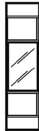
W 27.55" (70 cm)