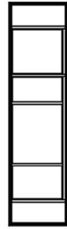
W 27.55" (70 cm)