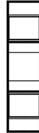
W 27.55" (70 cm)