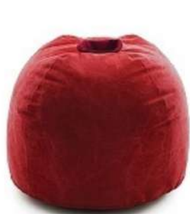
Soft Red Skin