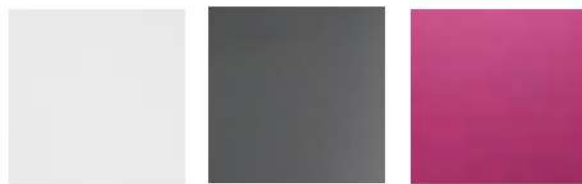
Glossy White Glossy Black Glossy Pink