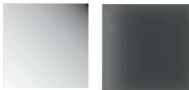
Standard Mirror Smoked Mirror