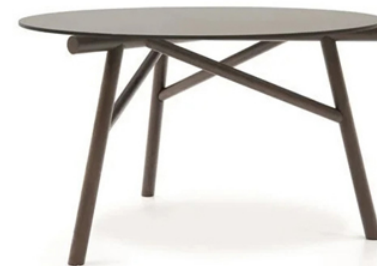
Model TOM14F / TOM16H

The meticulous woodworking of the ash, which is milled and turned, creates an extraordinary continuity between the surfaces both to the touch and to the eye, highlighting the old-fashioned craftsmanship that has gone into its making. All edges are rounded and, with the sinuousness of its joints, there are no sharp disconnects between the base and upper structure