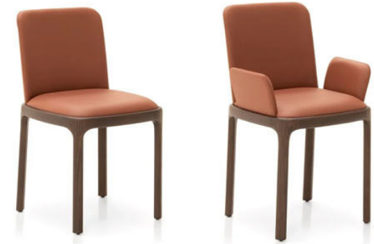
Model 01131 / 01132