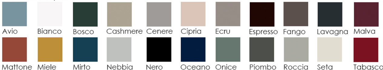
Avio Bianco Bosco Cashmere Cenere Cipria Ecu Espresso Fango Lavagna Malva Mattone Miele Mirto Nebbia Nero Oceano Onice Piombo Roccia Seta Tabasco