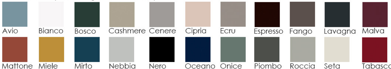
Avio Bianco Bosco Cashmere Cenere Cipria Ecu Espresso Fango Lavagna Malva Mattone Miele Mirto Nebbia Nero Oceano Onice Piombo Roccia Seta Tabasco