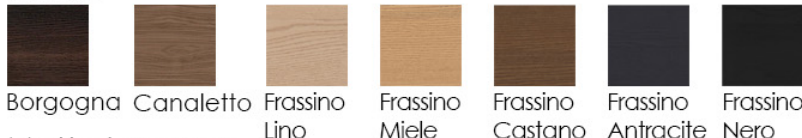
Borgogna Canaletto Frassino Lino Frassino Miele Frassino Castano Frassino Antracite Frassino Nero