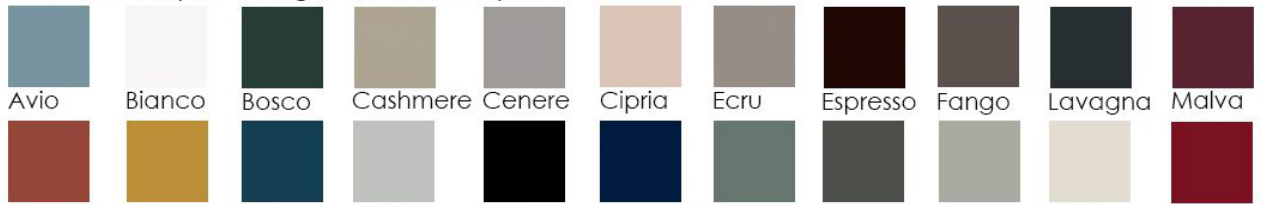
Avio Bianco Bosco Cashmere Cenere Cipria Ecu Espresso Fango Lavagna Malva Mattone Miele Mirto Nebbia Nero Oceano Onice Piombo Roccia Seta Tabasco