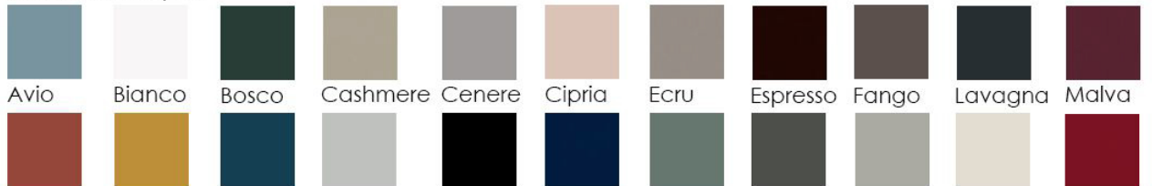
Avio Bianco Bosco Cashmere Cenere Cipria Ecu Espresso Fango Lavagna Malva Mattone Miele Mirto Nebbia Nero Oceano Onice Piombo Roccia Seta Tabasco