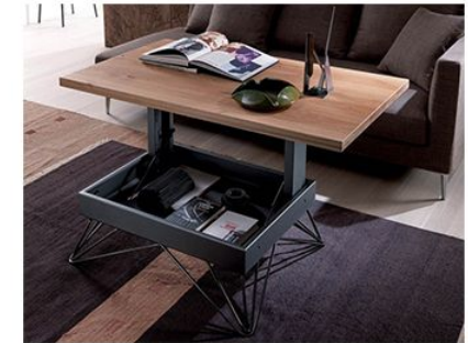
Radius Coffee Table For (68 x 117)

Convertible table in 2 heights (32 cm > 65 cm), metal frame and legs, wooden top, natural stone or marble glass sheet, self-braking gas lifting mechanism.