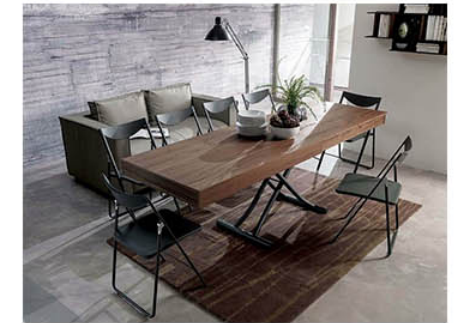
Newood Transformable Coffee Table

Transformable coffee table, metal base, gas mechanism adjustable to the millimeter in height from 23 cm to 80 cm, synchronized telescopic opening system of the extensions.