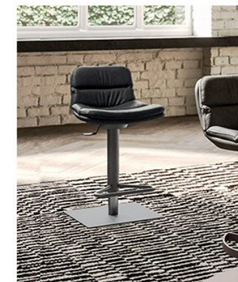
Morris Adjustable Height Bar Stool

This stool is available in all adjustable heights with gas piston and padded seat, upholstered in leather or velvet, with a cozy effect with seams that reveal their soft upholstery.