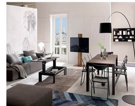
Metrino Coffee Table For (68 x 117)

Convertible table in 2 heights (32 cm > 65 cm), metalframe, wooden top, self-braking gas lifting mechanism.