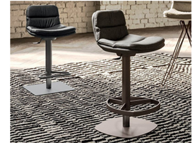
Marlon Adjustable Height Bar Stool

This stool is available in all adjustable heights with gas piston and padded seat, covered in leather or velvet, with a cozy effect with seams that reveal their soft covering.