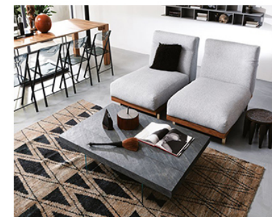
Markus Coffee Table For (90 x 140)

Two-heights (cm 32>cm 65) transformable coffee-table with metal structure, wooden top and seat glass, Self-braking gas-lifting device. Once opened, a part of the top become a bench.