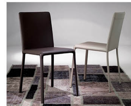
Lunette Upholstered Chair

Chair completely covered in leather, hide, eco leather nubuck or velvet.