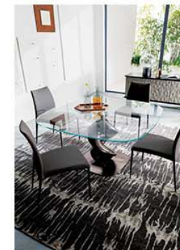
Liquid Square Fixed Dining Table (6 - Seats)

Dining table, base in metal and lacquered polyurethane, glass or ceramic laminated glass top.