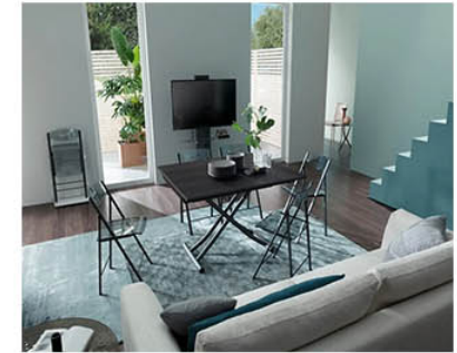
Leonardo Transformable Coffee Table

Convertible table becomes a dining table. Metal base with wheels and lift with gas piston. Adjustable in all heights to the millimeter