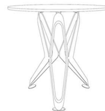
DNA XS Coffee Table (Ceramic)