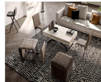
Box Transformable Coffee Table

The Box top seller is renewed through the precious Marble Glass with glossy and matte finish as well as the polished and anti-fingerprint crystal.