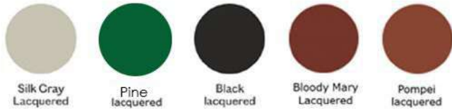
Silk Gray Lacquered