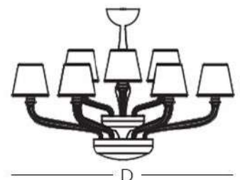
Wind Light 8-Arms Chandelier (WINSOV12)