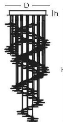
Potassium Chandelier (POTSOVBG07)

D= 22" (56 cm) H= 59.1" (150 cm) h= 2.4" (6 cm)