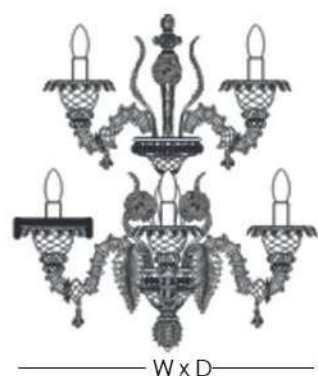
MURAPV05 (5 Lights)

W= 25.2" (64 cm) D= 15" (38 cm) H= 29.5" (75 cm)