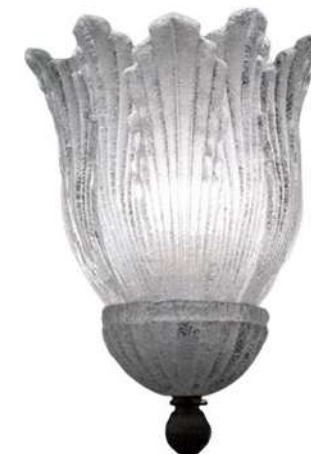
IPAAP07 (7 Petals)

W= 13.4" (34 cm) D= 8.3" (21 cm) H= 19.7" (50 cm)