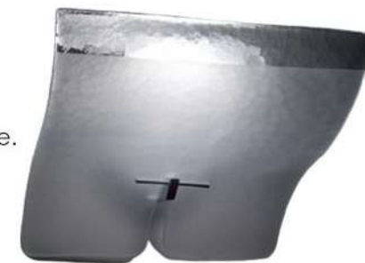
Flap Wall Lamp (FLAAPM)

The Flap wall lamp available in acidified white and transparent glass with satin nickel finish. The wing of an airplane, this reminds us of Flap, a contemporary decorative wall lamp, which does not forget the traditional style.