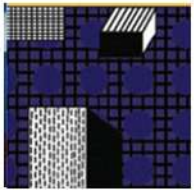
Blue Purple Yellow Black White LACH