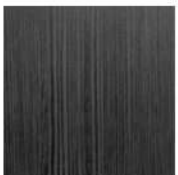
Black Stained Solid Ash Wood