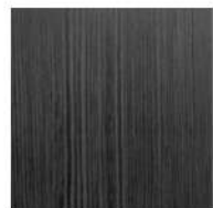
Black Stained ash