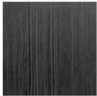
Black Stained Solid Ash Matte Wood