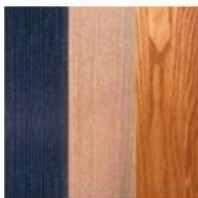
Blue And Pink And Orange Wood LACH