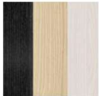
Black Tainted And Natural And Bleached Wood