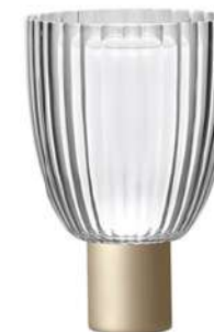
Table lamp in carved crystal with internal diffuser in blown and satin glass. Metal base with matte champagne, matte bronze or matte black finish.