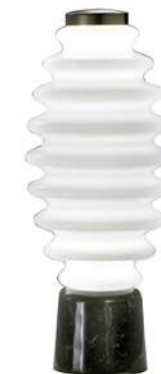
Table lamp with white blown glass diffuser. Base in gold calacatta or black marquinia marble. Metal parts with iron gray finish. Dimmer On request.