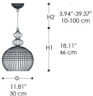
Amelie Pendant Lamp (8162/SP)

The Amelie pendant in transparent and teak carved crystal and metal with white and gold nickel finish.