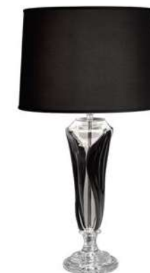
Table lamp in black and transparent cased crystal, diffuser in black fabric. Metal details with chrome finish. Available in chromatic variants. Classic Opera Catalog.